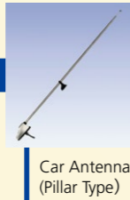
Car Antenna (Pillar Type)

Vehicle Communication Equipment Business 1957~