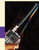
Personal Communication Antenna