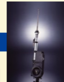
AM/FM Motor Antenna

The rod antenna for transistor radios, hit products at that time, was what propelled Yokowo Manufacturing Co., Ltd. to the forefront. Yokowo's high-quality antennas with their smooth extendibility based upon precision pipe processing technologies garnered recognition from electronics manufacturers. In this way, antenna technologies became a core business for the Company.