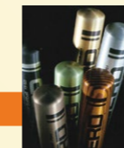
Metal Bats for Softball

In the midst of the leisure boom during the period of high economic growth, Yokowo took advantage of our pipe technologies to begin manufacturing and selling golf clubs and shafts. The Company has also expanded into metal bats and shafts for rackets.