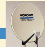
Outdoor Unit for BS