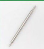
Spring Bar, Founder's Invention