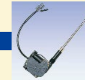
Motor Operated Conner Pole